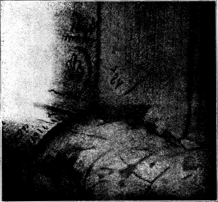
The Cabbalistic Inscription found on the wall of the Room in which Imperial Russian Family was murdered.